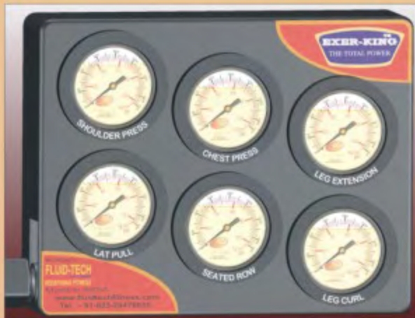
Six read-out gauges for indication of resistance for all six independent movements.